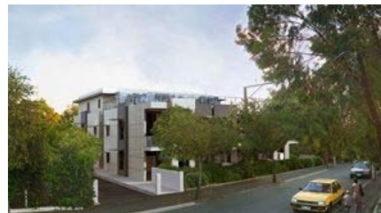
Artist impression of the retirement village planned for between Arthur St and Mary St, Unley.